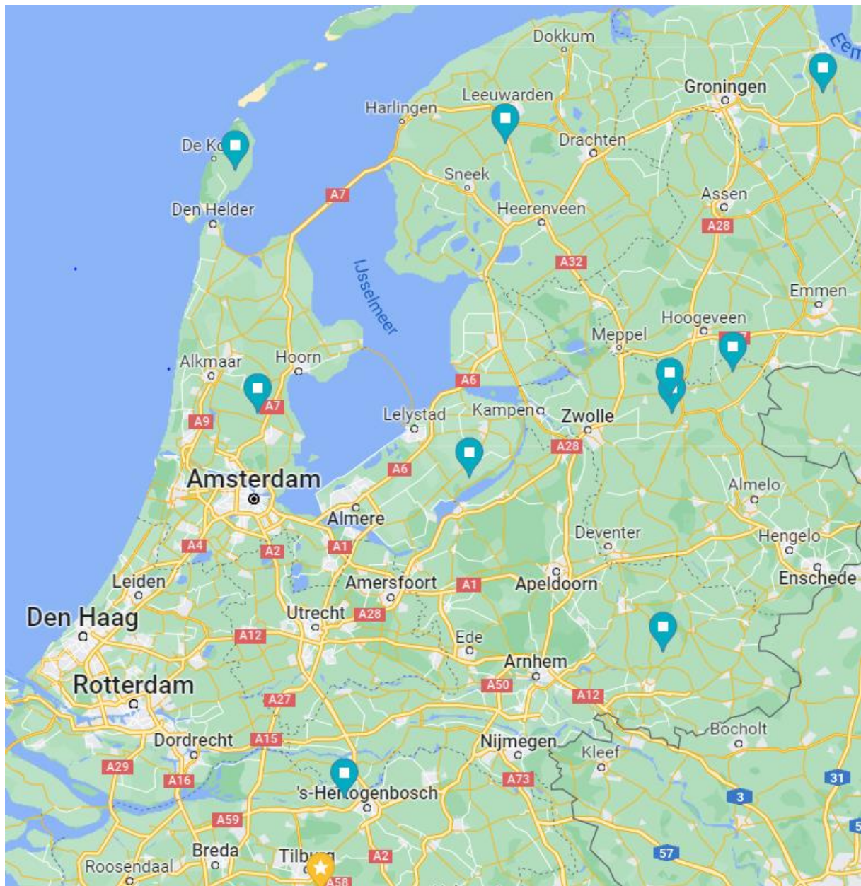
Figure 49. Location of the 10 pilot farms in the Netherlands.

The ten pilot farms are spread over the Netherlands and are depicted in Figure 49.