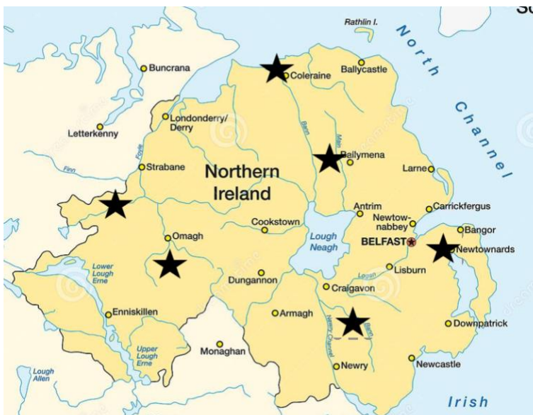
Figure 36. Location of the 6 pilot farms in Northern Ireland.

The 6 pilot farms are spread over Northern Ireland and are depicted in Figure 36.