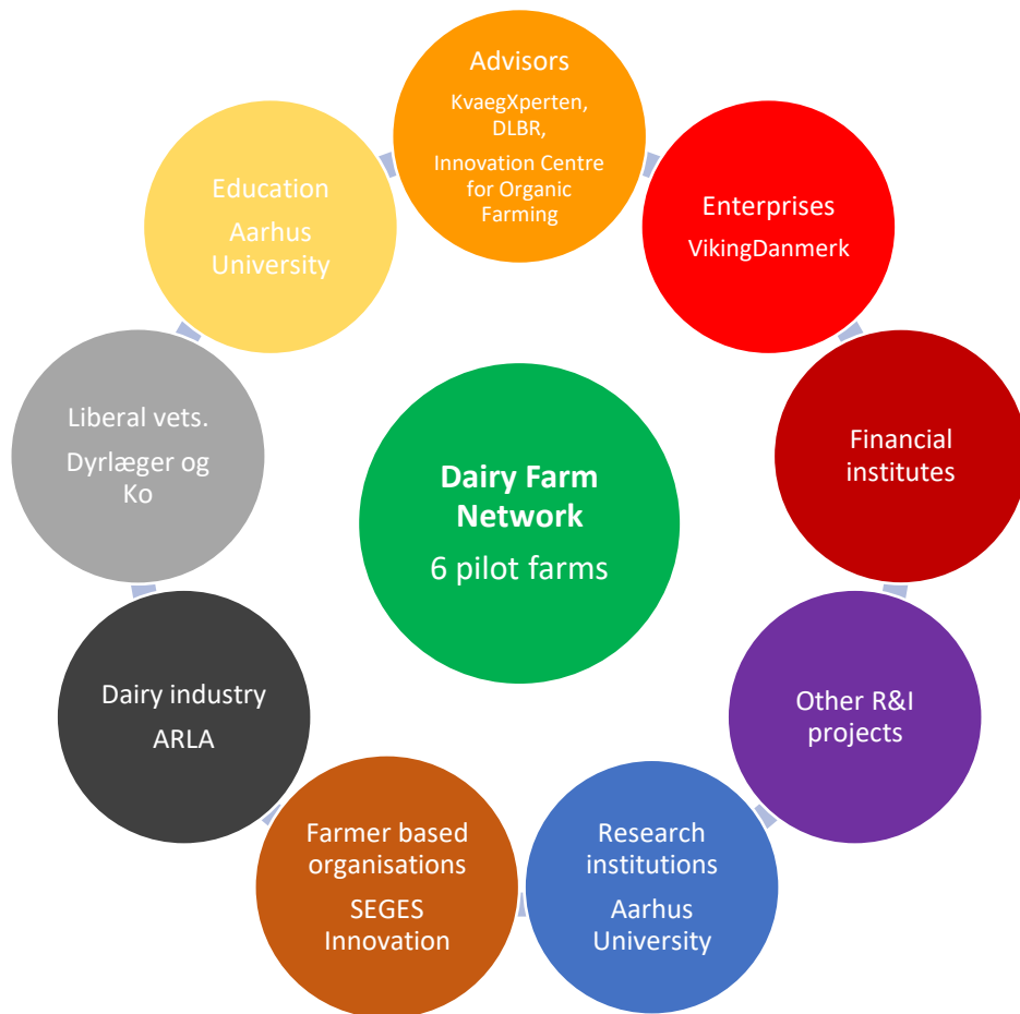
Figure 8. The Danish dairy AKIS of Denmark consists of 6 pilot farms and 6 non-farmer institutions each with their own expertise.

Below, each member will be described into more detail.