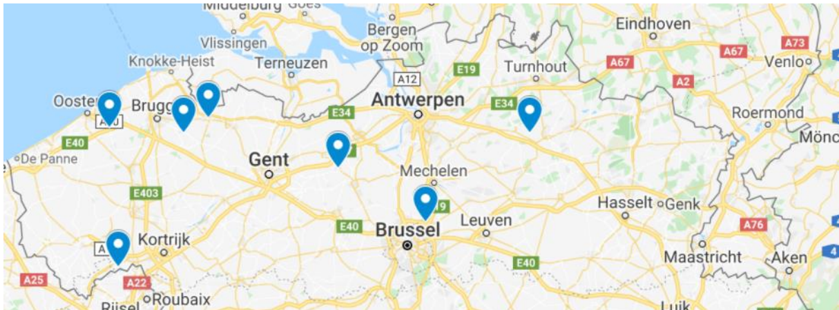
Figure 3. Location of the 7 pilot farms in Flanders (Belgium).

The seven pilot farms are spread over Flanders and are depicted in Figure 3.