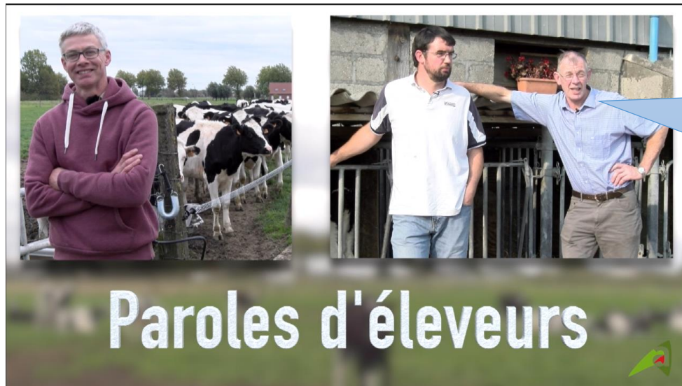
Quotes from the farmers

Capacity to adapt and maintain sustainability of the farm through social, economic, and environmental factors