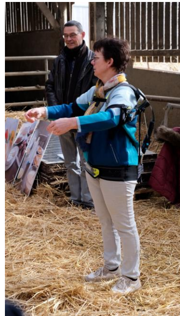
Use of an exoskeleton (R4D workshop, March 2023)