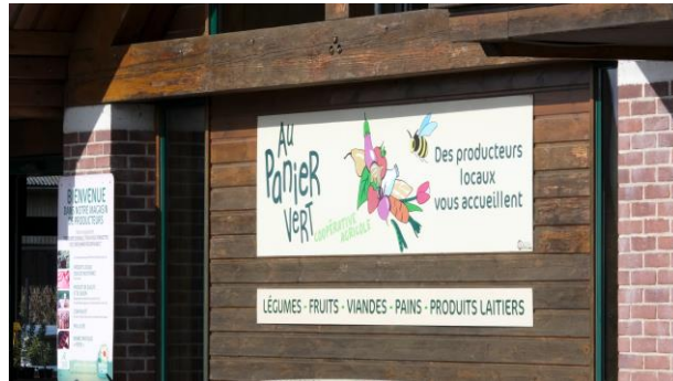
Diversification with a collective farmers shop (R4D workshop, March 2023)