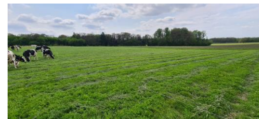
Topping (R4D, exchange between farmers on Whats app)