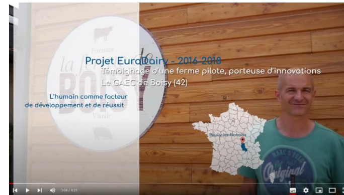
Human resources management (Eurodairy)