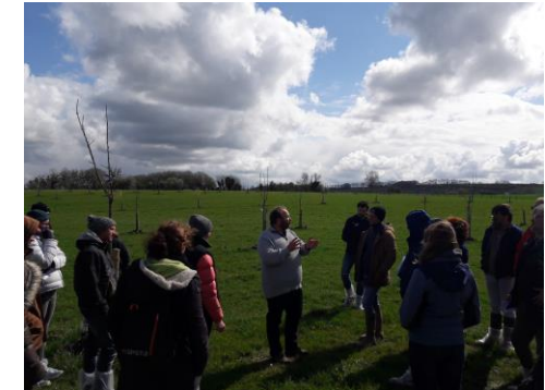
Agroforestry (R4D, French NDA meeting, March 2022)