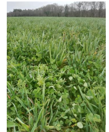
Mixed protein-cereal crop (R4D)